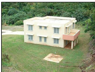
PICK THIS ONE!